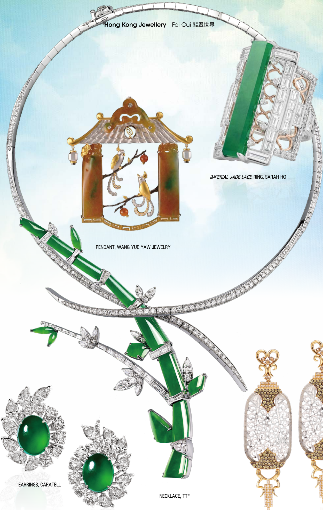
PENDANT, WANG YUE YAW JEWELRY