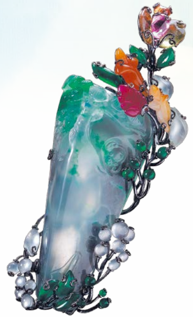
後山 PENDANT, ART JADE JEWELLERY