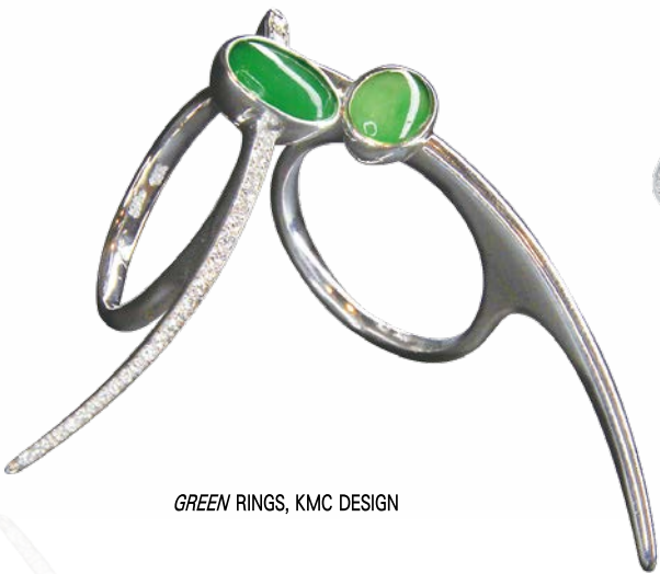
GREEN RINGS, KMC DESIGN