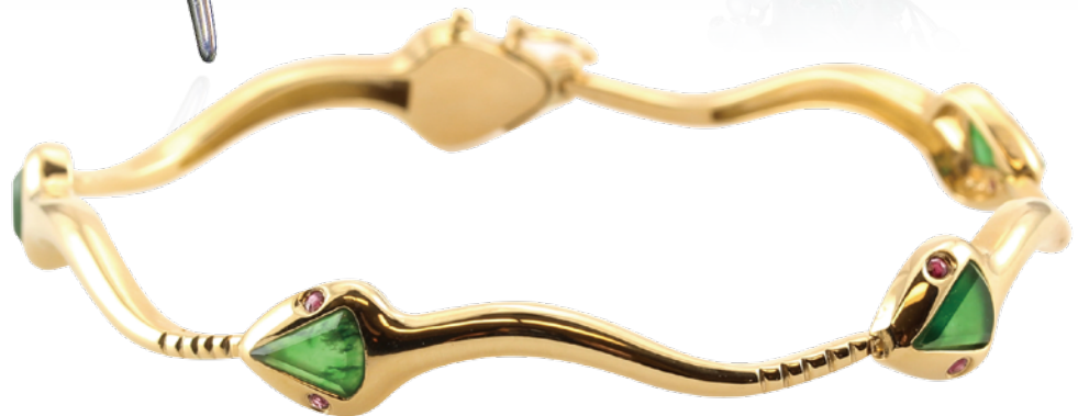
SNAKE BRACELET, MASON-KAY JADE