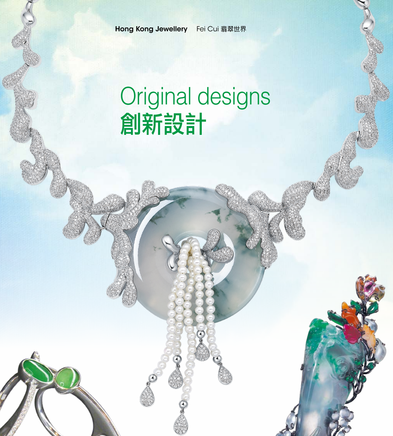
WATERFALL NECKLACE, FEI LIU