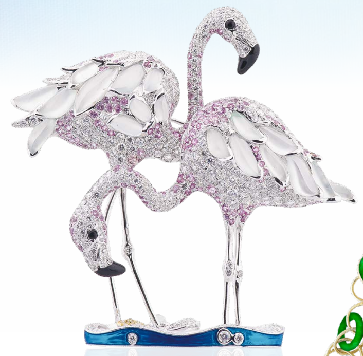
PENDANT, LIANGHER JEWELLERY