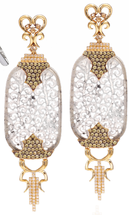
EARRINGS, WENDY YUE, HONG KONG