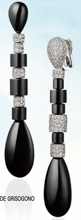
TUBETTO EARRINGS, DE GRISOGONO